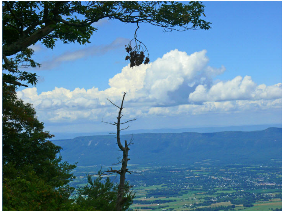
Scene of the Shenandoah Valley during the Skyline Drive summer trip. Photo by Larry Meade. The bird atop the snag is an Indigo Bunting.

The Northern Virginia Bird Club had two excellent out of town trips this summer. They were what we call "X-trips" where we leave early and drive to a relatively far-flung location and bird into the late afternoon. In early July, we ventured up to Skyline Drive and birded the Limberlost Trail which is located near Skyland. The trip was led by Elton Morel and me. The highlight of the morning was a spectacular look at a cooperative male Blackburnian Warbler actively feeding above our heads. He even reappeared a bit later to put on a show for people in the group who had missed him when he was first sighted. We later found a female Blackburnian a little further up the trail. We also enjoyed Chestnut-sided, Black-and-white, and Hooded Warblers. American Redstarts were ubiquitous. Veery and Wood Thrushes entertained us with their singing. Scarlet Tanagers and Rose-breasted Grosbeaks grudgingly let us glimpse them as they sang in the tree tops. Canada Warblers had been reported in the area, but we dipped on them. We found some more birds in other locations along Skyline Drive such as Dark-eyed Juncos, a Broad-winged Hawk and a Ruby-throated Hummingbird. As usual, there were many Indigo Buntings and Eastern Towhees.