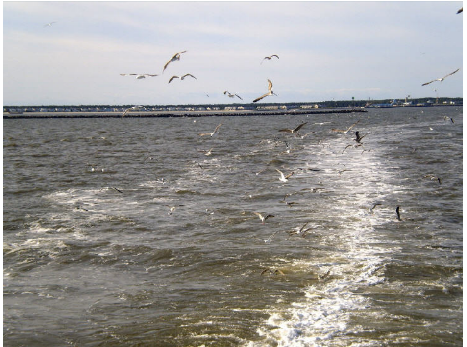
Scene on the Delaware coast near Camp Avocet.