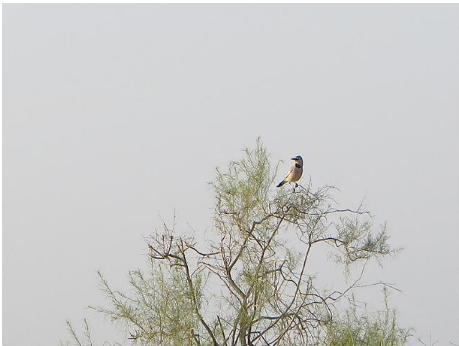
Pander's Ground Jay.

Green carpets rolled across these flat steppes, as far as the eye could see, only to turn brown in another month. Infrequently a river with its attendant trees and shrubs cut through the carpet, and one of the low-lying lakes produced a first for the region—a long-tailed duck.