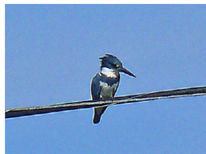
Belted Kingfisher on NVBC's October 5 walk at Silver Lake Regional Park