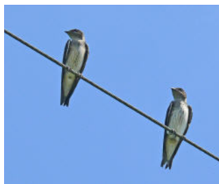
Juvenile Purple Martins at Bombay Hook.