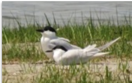
Photographs at Chincoteague (above, top to bottom):

Piping Plover Marbled Godwit Gull-billed Terns