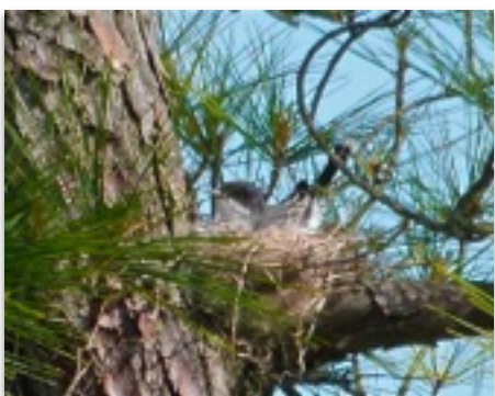
Photographs above (top to bottom): Windblown Snowy Egret at Chincoteague and Yellow Warbler with caterpillar at Saxis WMA Eastern Kingbird on nest at Saxis WMA