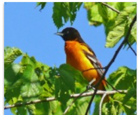
Baltimore Oriole at Dyke Marsh