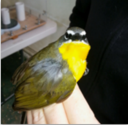
Occoquan Bay NWR banding station photographs by Bill Teetz: