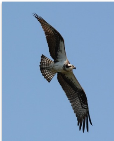
Photograph of Osprey by Gerco Hoogeweg