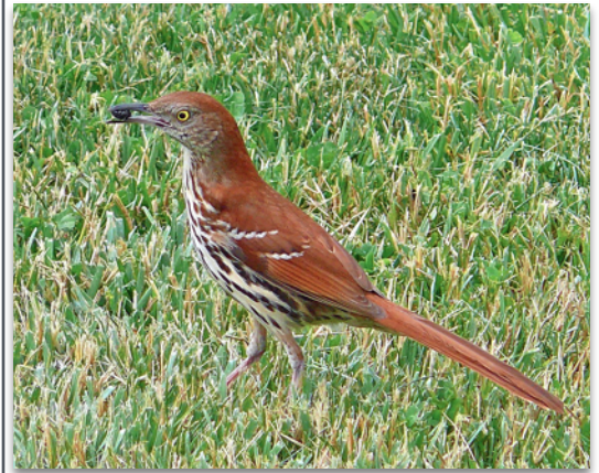
Brown Thrasher at Green Spring Gardens Park.