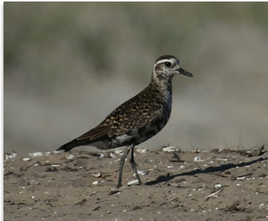
American Golden Plover Photograph by Larry Wright at Chincoteague