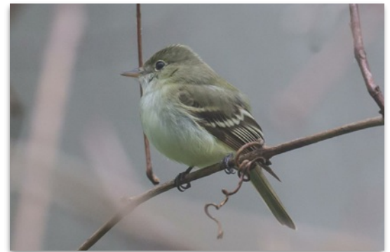
Acadian Flycatcher