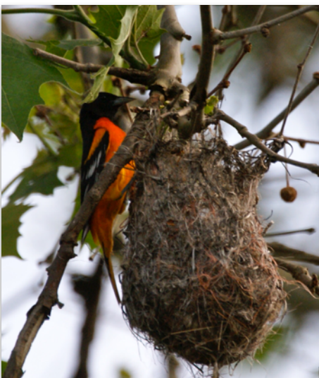
Baltimore Oriole at nest

Ten NVBC members participated in the 2015 spring trip to Highland County, June 5-7. The participants stayed at the Highland Inn, with breakfast each morning, and had group dinners at High's Restaurant in Monterey, Virginia. A total of 77 species were seen or heard (16 heard only). Highlights of the trip were sightings of Red-headed Woodpecker, Bobolink, Chestnut-sided, Blackburnian and Mourning Warblers, Yellow-billed Cuckoo and Baltimore and Orchard Orioles. The pair of Baltimore Orioles made repeated visits to a nest. The usual targeted Golden-winged Warblers, along with an Alder Flycatcher, were heard but refused to show themselves to the group