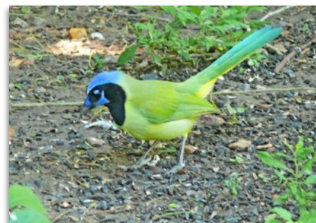
Photographs above: Great Kiskadee at Hugh Ramsey Nature Park and Common Pauraque at Estero Llano Grande State Park Green Jay at Laguna Atascosa NWR