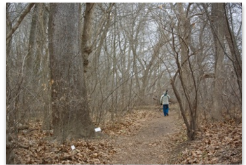
Walking the trail at Riverbend Park.