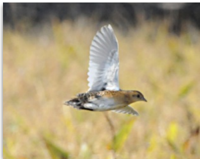
Yellow Rail in flight