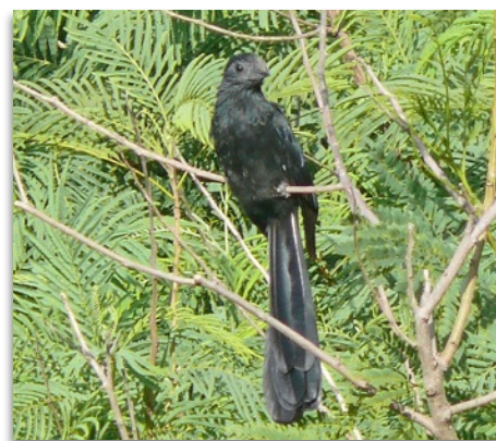
Grooved-bill Ani at South Padre Island.