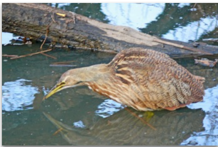
American Bittern at Dyke Marsh during CBC week.