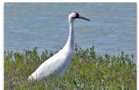
Whooping Crane at Aransas NWR