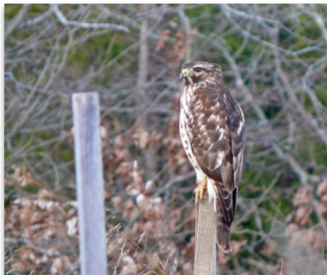
Juvenile Red-shouldered Hawk at Haymarket. Photograph by Larry Meade.