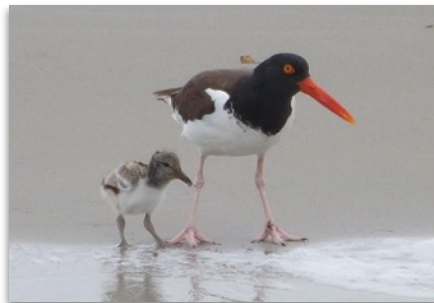
taken during the Chincoteague trip: from top: Indigo Bunting, Yellow-breasted Chat, American Oystercatchers

On Sunday morning, the group took a boat trip out of the Curtis Merritt Marina at the south end of Main Street, and cruised the Chincoteague Bay Channel and Assateague Channel Areas. The highlights of the cruise were closeup views of several Red Knots and Marbled Godwits, an Oystercatcher feeding young, Ospreys, Bald Eagles (including one attempting to pirate a fish from an Osprey), Whimbrels, Brown Pelicans, Common Loon and Red-breasted Merganser.