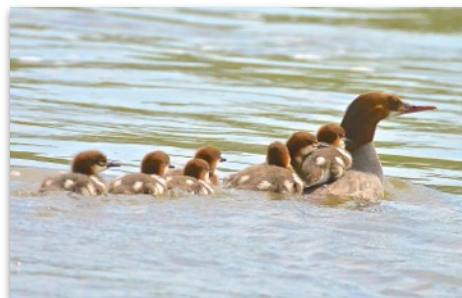
of Common Merganser Mom and brood at Great Falls Park, Virginia