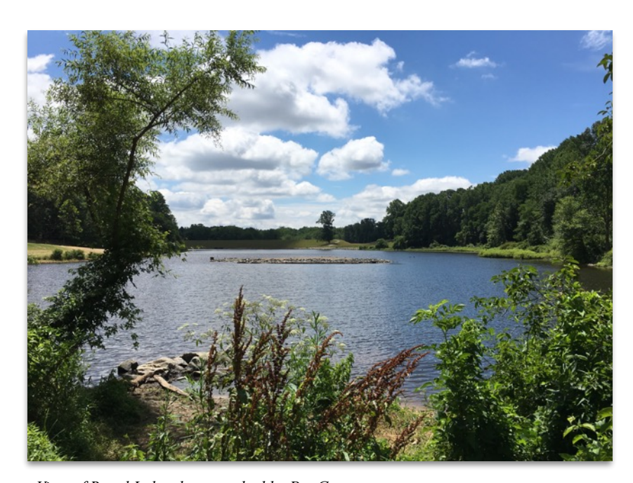
View of Royal Lake