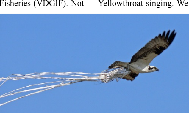
Osprey streaming nesting material

eyes." I find myself automatically noticing bird behavior in a more analytical way than I did before the atlas began. For example, it seems like every time I look at a bird, I check to see if it is carrying something in its bill which would likely mean it's a confirmed breeder. Another good way to confirm breeding birds is to find babies. On a recent walk for NVBC, our group found a Common Yellowthroat singing. We waited a bit instead of moving