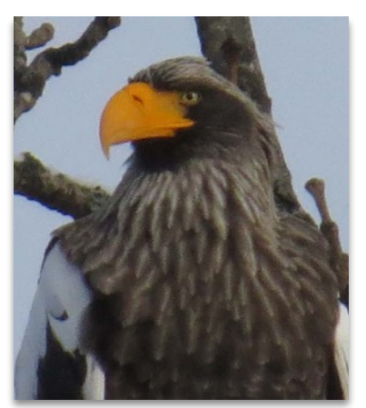
Steller's Sea Eagle