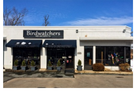
10% Birder Discount to NVBC members at Birdwatchers Seed and Supply Company.

NOTE : new meeting location for Great Falls walk