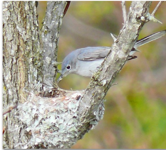
Blue-gray Gnatcatcher making a nest at Occoquan Bay NWR

priority atlas block near Merrimac Farm in Prince William County. This year we have scheduled some more block busting trips to parts of Virginia that also need help.