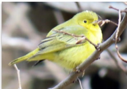
Yellow Warbler at Leesylvania State Park CBC