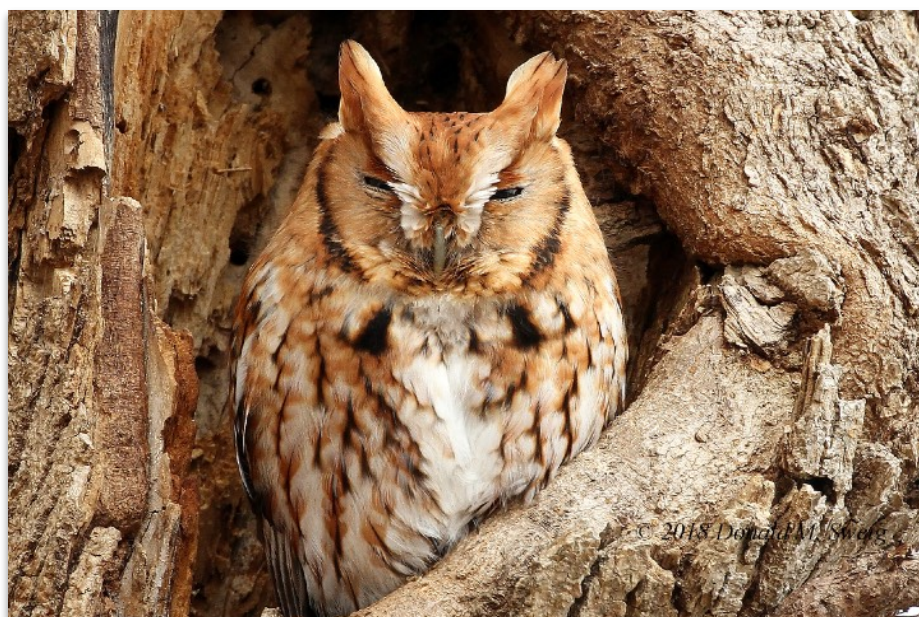
Red morph Eastern Screech-Owl ( Megascops asio ) discovered during a Great Falls Sunday bird walk in January 2018.

Trillium Trail-G. Richard Thompson Wildlife Management Area (5/5) (Fauquier Co) From I-495, take I-66 west 51 mi. to Linden exit (Rt 79). Go left (south) from exit ramp on Rt 79 approx. 1000 ft. to Rt 55. Turn left (east) onto Rt 55; go 1.2 mi. to Rt 638 (Freezeland Rd). Turn left (north) onto Rt 638. Follow Rt 638, as it bears right, 5.3 mi. to Trillium Trail Parking Area on right—look for sign on kiosk. (Parking Area is just before radio towers.) Note: participant must have an access permit issued by VA Department of Game and Inland Fisheries, www.dgif.virginia.gov , 1-866-721-6911.