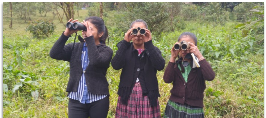
CCFC Kids & Birds participants