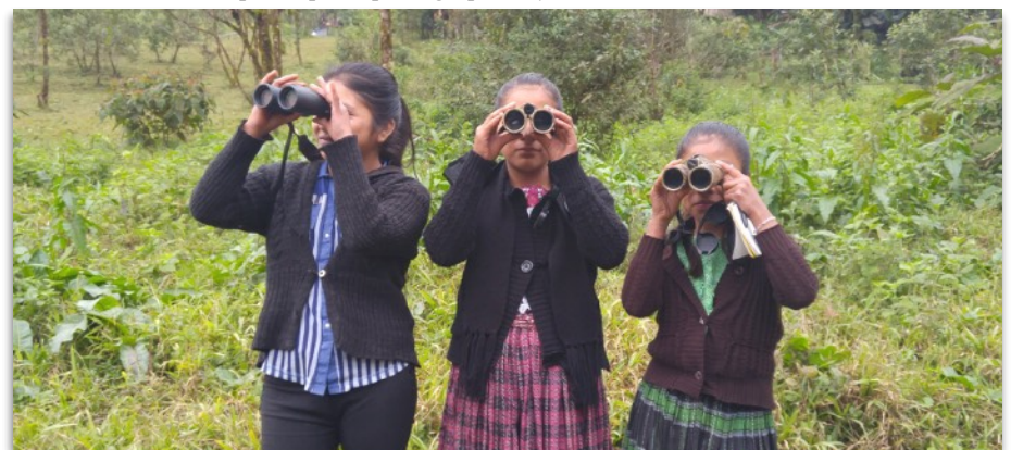
CCFC Kids & Birds participants