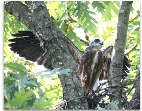
Above left: Mating Mississippi Kites near Green Spring Park, May 15, 2018. Note the red eyes of both adult birds and the rufous color of the outer primary flight feathers of the male. Middle: Mississippi Kite chick in nest, July 20, 2018. Right: Mississippi Kite chick exercising its wings in nest, July 29, 2018. The chick fledged two days later.

The Summer of 2018 offered Northern Virginia birders the opportunity to see and enjoy two species of elegant and beautiful kites. The pair of Mississippi Kites, Ictinia mississippiensis , that nested in 2017 near the Green Spring Gardens Park in Fairfax County returned to nest in mid-May; at about the same time another pair nested in a residential area not far from Monticello Park, in Alexandria. Both of these pairs reportedly successfully fledged one chick. Other pairs were also reported to have successfully nested in Fairfax and in Prince William County.