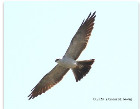
Photographs above left: Swallow-tailed Kite, Loudoun County, August 14, 2018. This may not be a full adult bird as it does not have the two, very long, outer tail feathers (rectrix 6) that distinguishes a fully adult kite and gives the bird its swallow-tailed appearance. Otherwise the plumage is similar. Middle: Iconic view of the Swallow-tailed Kite, with its long, forked tail, Loudoun County, August 14, 2018 Right: Adult Mississippi Kite near Green Spring Park, May 20, 2018.