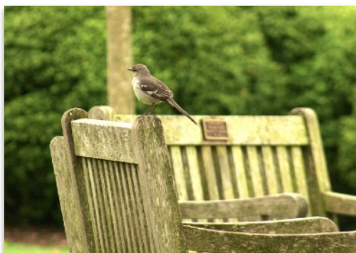
Mockingbird on bench at Fort C. F. Smith Park