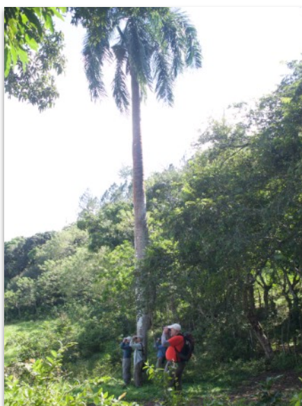
Birders at the Tree Bank project in the Dominican Republic