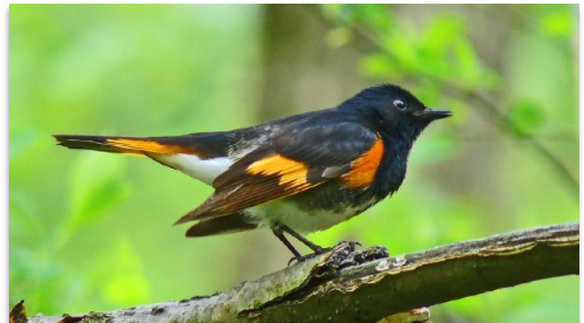
American Redstart