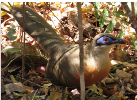
Coquerel's Coua