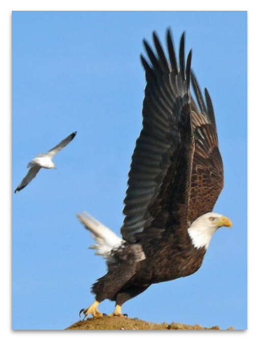
Bald Eagle at the Prince William County Landfill

Turn left onto Thoroughfare and go 0.3 mi. There are parking lots on both sides of the road. Meet in the right hand (west) parking lot. The left hand (east) parking lot can be used for overflow parking.