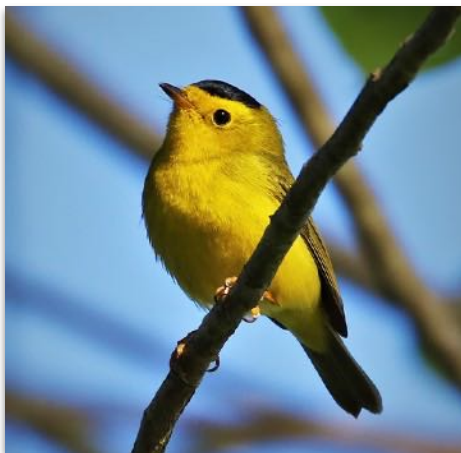
Below Wilson’s Warbler at Occoquan Bay NWR

only 11 warblers. But it turned out to be a banner day for me. After a slow morning of birding, we were heading back to the cars when I thought I saw a female scarlet tanager. We continued a little way further then I spotted a brilliant male scarlet tanager, closer to us, out in the open, among the white flowers of a locust tree. It was feeding there and we got a great, unobstructed view. Then close by it, another equally brilliant male scarlet tanager started feeding. We had 2 spectacular males visible in one binocular view. The females appeared nearby so there was no squabbling between the males. The 2 couples stayed, feeding around the white flowers for easy contrast for a long time. Several times we could see the 2 males in the same view! I don’t ever recall such magnificent views of scarlet tanagers, which I have seen annually for about 25 years. It was thrilling to see. Finally the foursome flew off and we continued to our cars