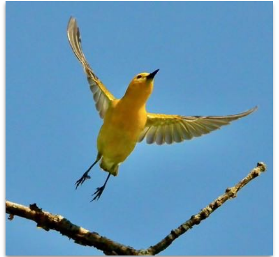
Prothonotary Warbler feeding young (left) and taking flight (above) at Occoquan NWR