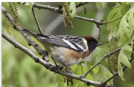
Bay-breasted Warbler