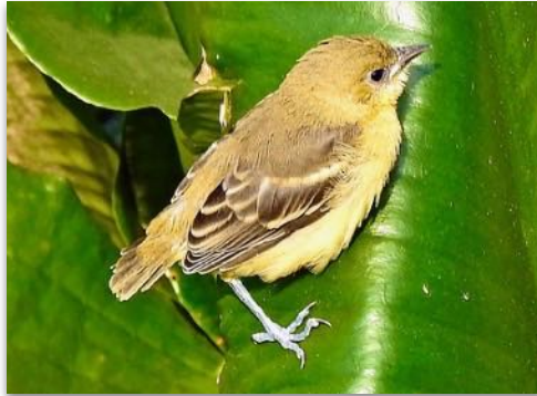
Baby Orchard Oriole at Neabsco Boardwalk

fledged birders after things get more normal. Many of us who were already birders have been getting out and doing "lone wolf" birding or have been birding in a small group. I have been exploring some new places in an effort to avoid crowds. Taking it slow and watching birds going about their business can be very rewarding. In this issue of The Siskin, some NVBC members have shared some stories and photos related to their birding experiences in the pandemic. I think that we are lucky to have this hobby that gives us a reason to get out of the house and that also keeps our minds engaged as we explore nature.