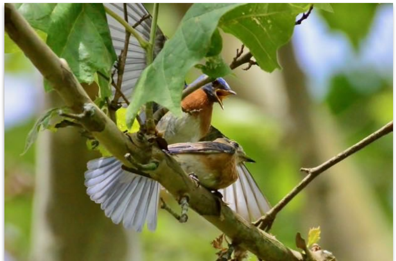
Bluebirds mating photographed on the Accotink Creek Trail in Fairfax City

Right column: Seth Honig photographed at home: Blue-winged Warbler, Summer Tanager, Ovenbird.