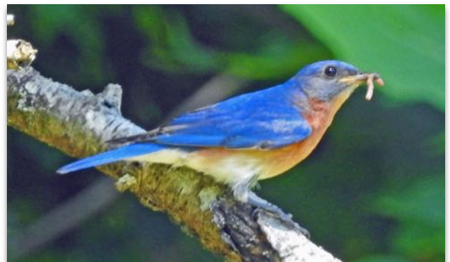
Eastern Bluebird at Clark's Crossing Park