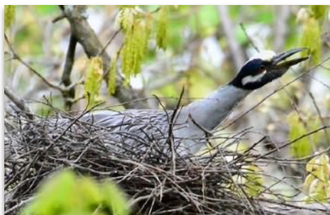
Yellow-crowned Night-herons on nest and young observed at various stages and photographed by Seth Honig in Falls Church