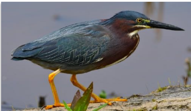
Green Heron at Huntley Meadows Park