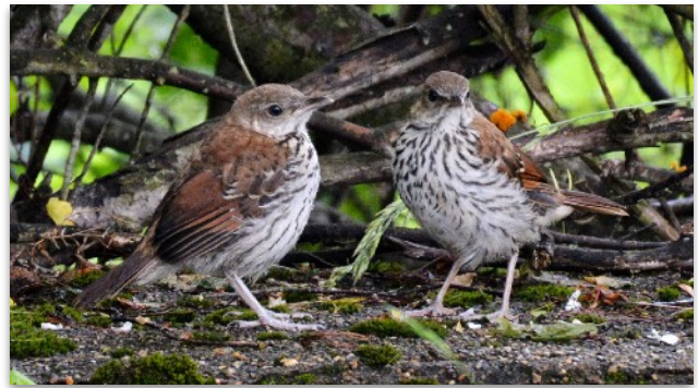
Pair of fledged Brown Trashers waiting for food at Little Georgetown Cemetary, Thoroughfare Gap CW, Fauquier County

with at least 11 possible breeders (including Kentucky Warbler!).