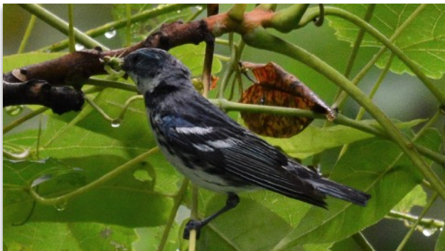
Cerulean Warbler gathering food near the end of Bean Hollow Road, Chester Gap SE, Rapahannock County

Improved understanding on the breeding range of other warblers was obtained. For example, Kentucky Warbler used to be a widespread uncommon/common breeder across the Northern Region; now it is rarely encountered. And, we learned that the Aquia Landing/Raven Road/Crow's Nest area is an excellent warbler area