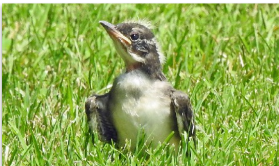
Baby Eastern Kingbird at Jefferson District Park in Merrifield.