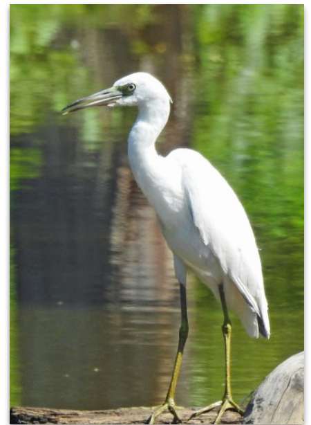
Juvenile Little Blue Heron at Huntley Meadows