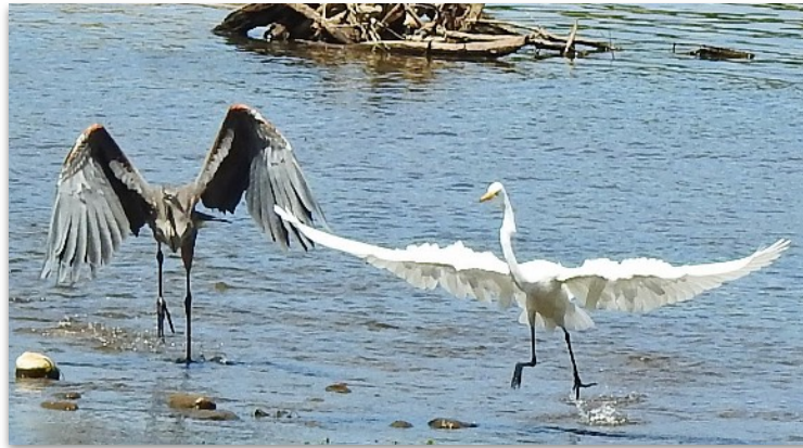
Great Blue Heron and Great Egret at Algonkian Park, Ashburn