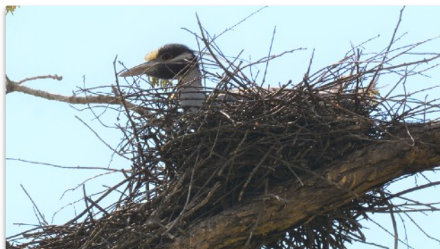
Yellow-crowned Night Heron on nest near Jaguar Trail pond, Annandale NW, Fairfax County

Black Vulture was once difficult to find during the breeding season in the Northern Region as the first Atlas had only 3 confirmed blocks. This Atlas has at least 29 confirmed blocks!