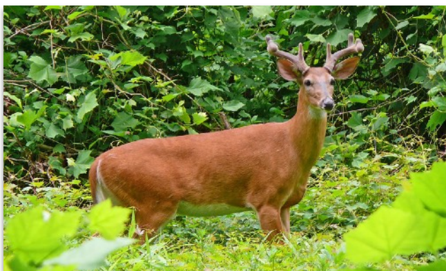
Buck in velvet at Holmes Run Stream Valley Park, Annandale