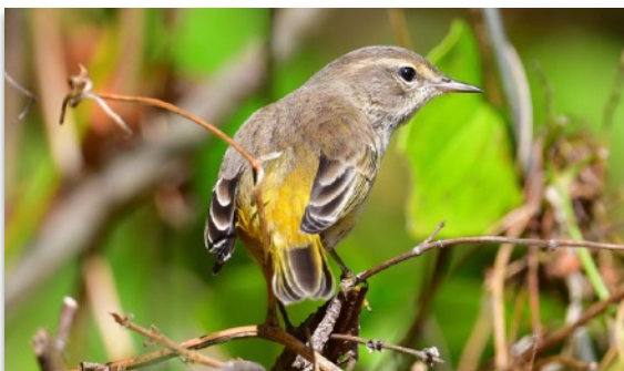
Palm Warbler at Occoquan Bay NWR; one of the migrating warblers.