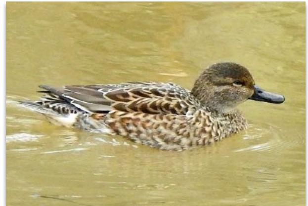
Photographs of male and female Green-winged Teals taken at Huntley Meadows