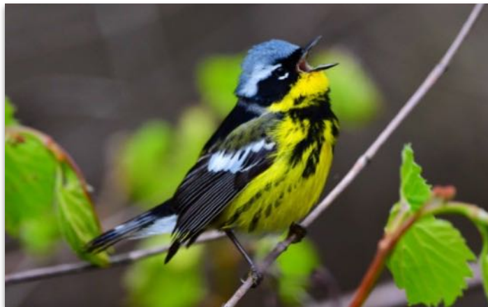
Magnolia Warbler at Magee Marsh, Ohio in May 2019

The February virtual meeting will be held using Zoom. The meeting begins at 8 pm, and you can enter after 7:30 pm. Please register in advance by clicking on the registration link found at the upper right at the Northern Virginia Bird Club web site ( nvabc.org ). Upon registering, an email automatically will be sent with a link to join the meeting. There will be ample time for questions from the audience.